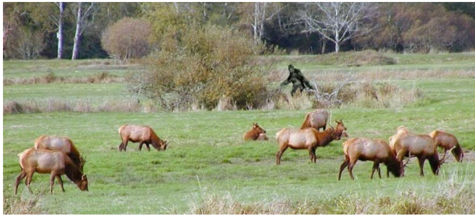
This PhotoShop'd image makes a good point